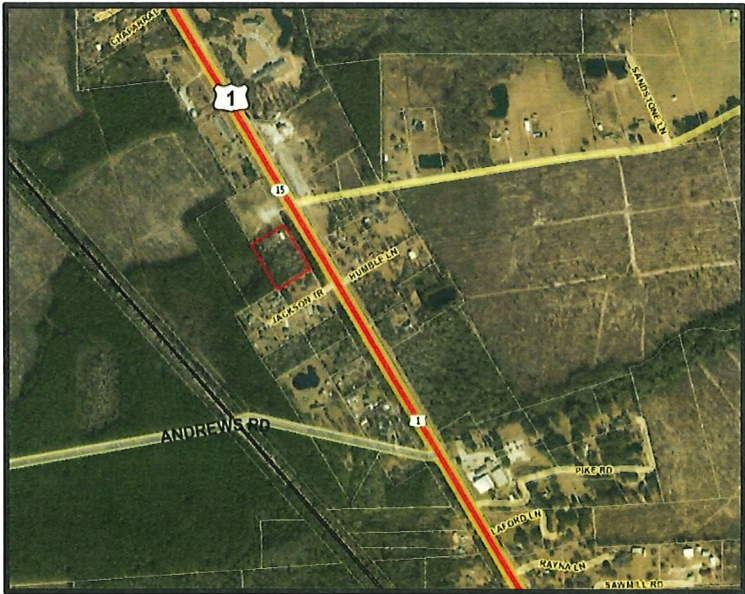
Parcel #s 30-4N-24-2740-0003-0000

The land reclassified by this Ordinance is owned by 553519 US 1 Trust and is identified by the following tax identification numbers, graphic illustration, and legal description: